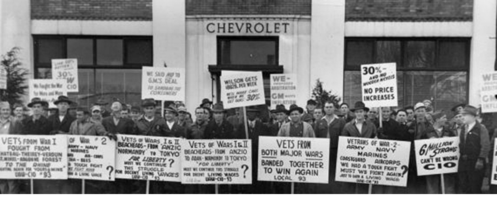
UAW workers picket outside Chevrolet, a GM subsidiary, at the onset of the strike in 1945 ("1945: UAW Initiates Strike...")