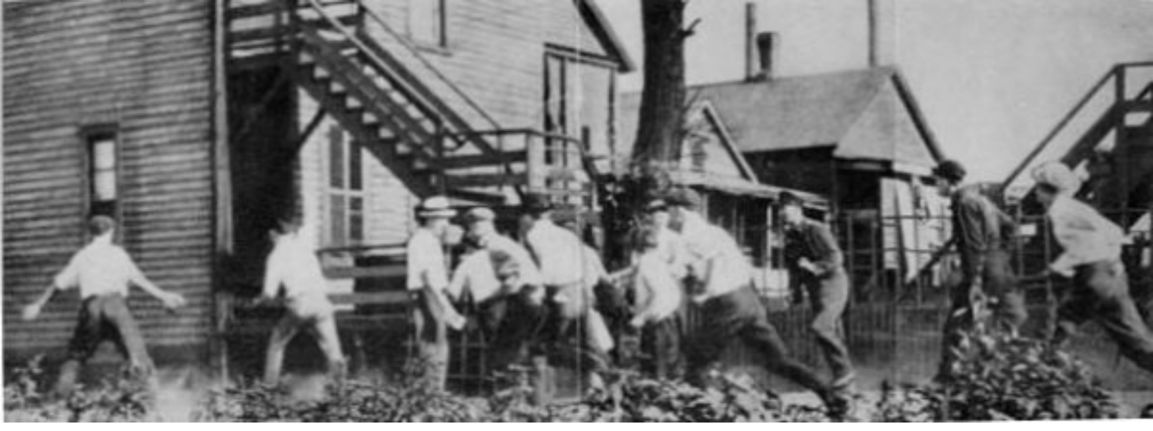
White Chicagoans looking for African Americans during the race riots of 1919 ("Chicago Race Riots of 1919")