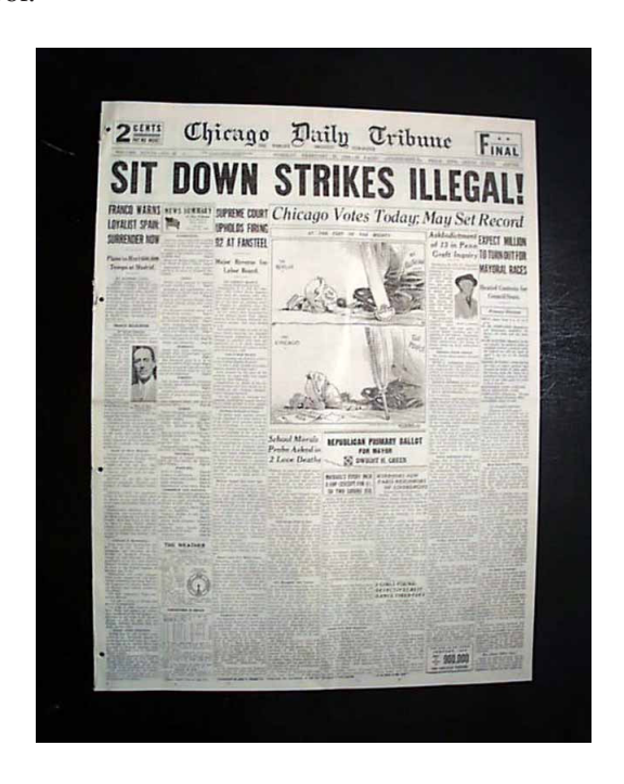
Chicago Daily Tribune headline on results of NLRB vs Fansteel Metallurgical Corp. ("Sit Down Strikes Goes to Supreme Court...")

There were still some losses for the labor movement in the midst of all of this success. One example is that of NLRB v. Fansteel Metallurgical in 1939, a Supreme Court decision regarding a 1937 sit-down strike which resulted in the firing of 90 workers. The NLRB ruled that the company had to reinstate the fired workers, however the Supreme Court disagreed. They ruled that the sit-down strike was an "unlawful taking of property" and was not protected under the NLRA. Additionally, they ruled that the NLRB did not have the authority to force the company to reinstate fired workers who participated in taking of property ("NLRB v. Fansteel Metallurgical Corp"). This, in practice, ended the sit-down strike, one of the most prominent and powerful tactics of organized labor.