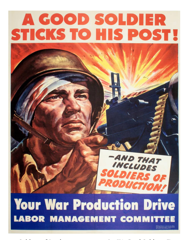
Soldiers of Production poster, 1943 ("A Good Soldier...")