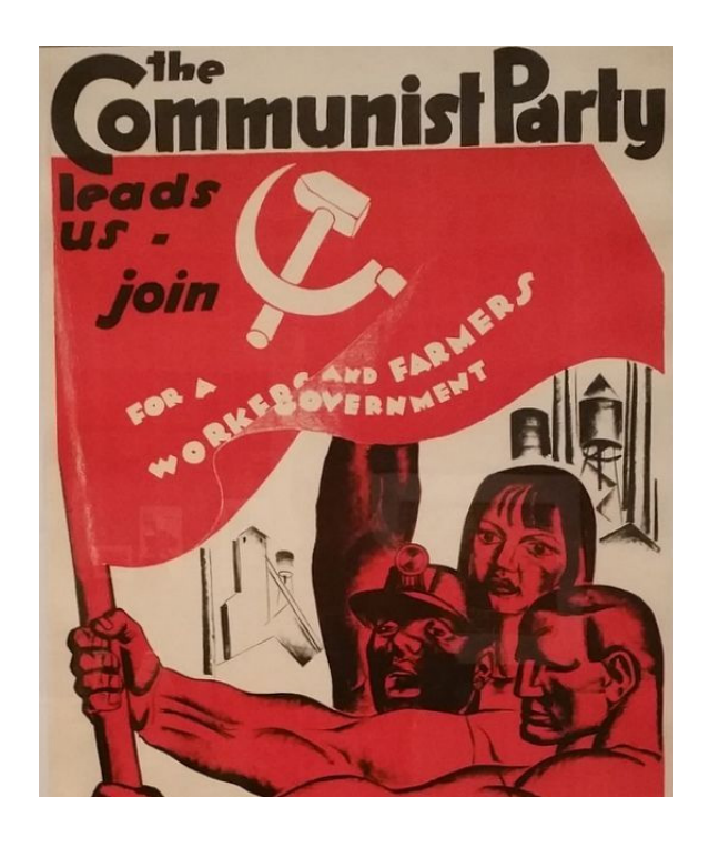
Poster for the Daily Workers, 1935 ("Communist Party History...")

Communist parties began forming in the US after the October Revolution in Russia, with many coming, going, and merging, until a final consolidation into the Communist Party of the United States of America (CPUSA) in 1929. Throughout the New Deal era, the CPUSA became important players in the labor movement, with around 65,000 members and significant involvement as industrial union organizers. By the 1940s, they had significant importance in many CIO unions ("Communist Party of the United States").